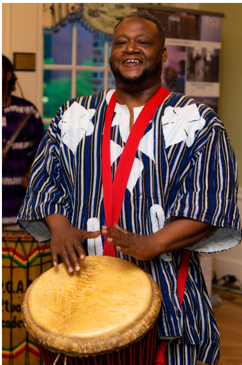
Urban Foli https://www.urbanfoli.com